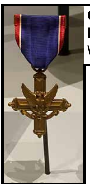
Courage Distiguished Service Cross WWII - First in War Exhibit