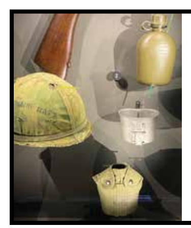
Canteen Compate to your bike helmet. What do you drink out of on a long trip?