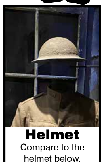
WORLD WAR II