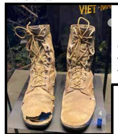
Boots Have you ever worn your shoes so much they got a hole in them?